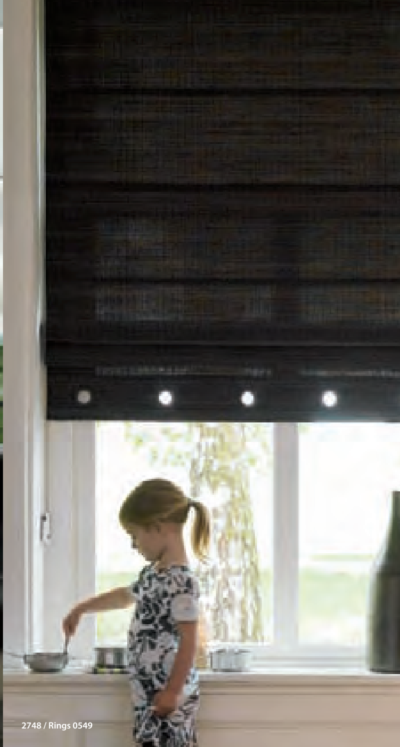
2748 / Rings 0549

Rings can be applied to the flounce in unlined ballina and linea models. As an extra decoration a tape can be woven through the rings. Another variant is a border around the edge of a Roman Shade in the same quality of material but, for example, in a contrasting colour. A flounce can also be adapted in this way according to your wishes. In order to emphasise the horizontal display of lines in a Ballina Back. Why not add cord piping in either a matching or contrasting colour? The possibilities are endless. Your Luxaflex® dealer would be delighted to assist you in selecting the most beautiful combinations.