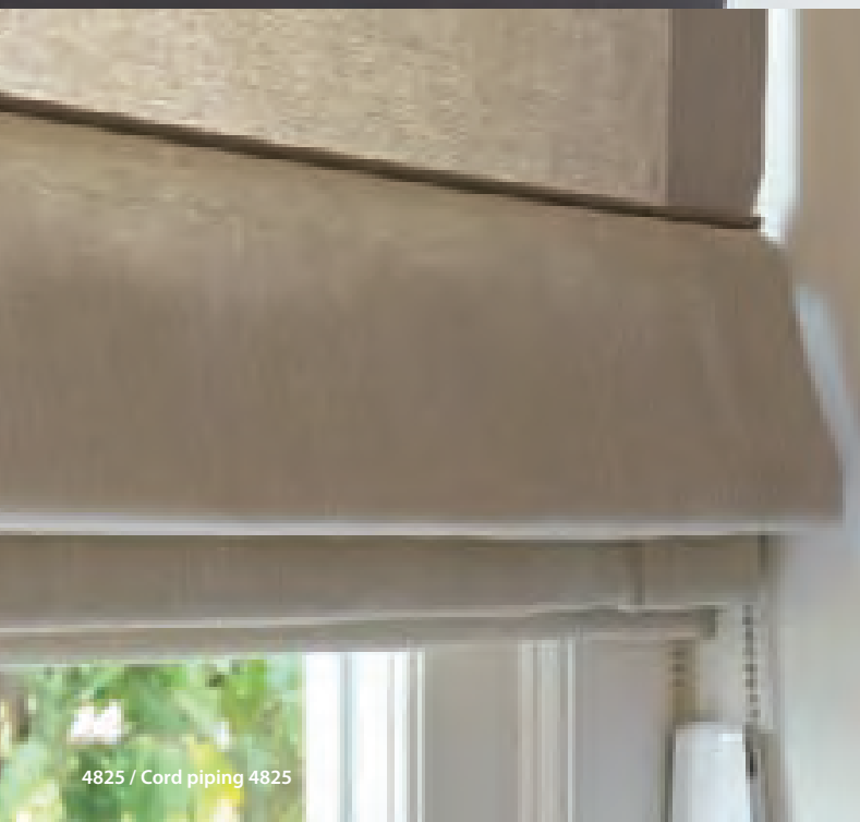
4825 / Cord piping 4825