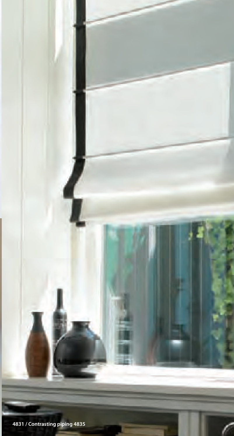
4831 / Contrasting piping 4835