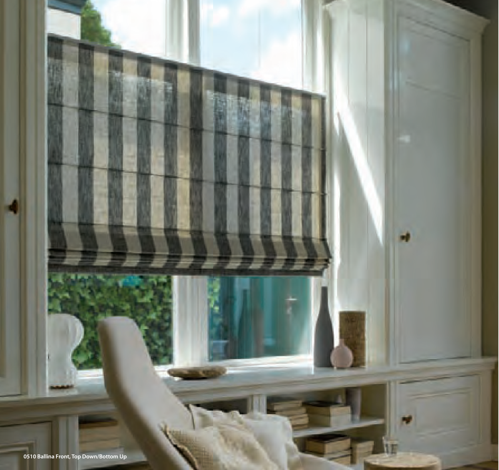
0510 Ballina Front, Top Down/Bottom Up